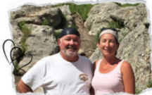
Camping available Lobies Park, Walkerton

Bar: 11:00 - 8:00 Music - Live entertainment by After Midnight 3 Sets - 3:00, 4:30 & 6:00 pm