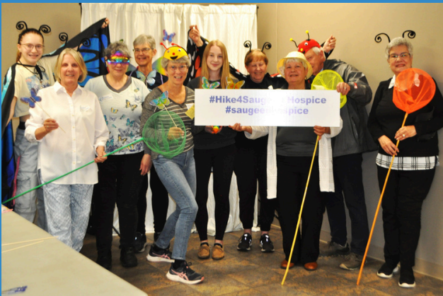
A few of the volunteers from the Walkerton Hike for Hospice - thank you to all!